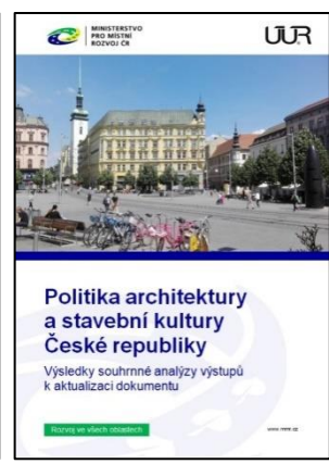
Fig. 2 – Architecture and Building Culture Policy of the Czech Republic – Analysis of Foreign Materials and Recommendations

Fig. 3 – Architecture and Building Culture Policy of the Czech Republic – Analysis of Recommendations of Professional Organisations for the Updating Purposes