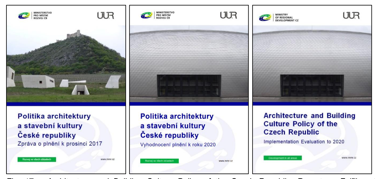
Fig. 17 – Architecture and Building Culture Policy of the Czech Republic. Report on Fulfilment to December 2017

On 15 March 2021, the Government, by its Resolution No. 287, imposed the development of the Architecture and Building Culture Policy of the Czech Republic Update to 2022, taking into account the material "Suggestion for the update". The latter was intended as a base resource for discussion. It contains possible topics that needed to be examined by the update. The suggestions presented in this material were based on the Architecture and Building Culture Policy of the Czech Republic Implementation Evaluation, on the analysis of foreign materials and on the recommendations of professional organisations for updating the document. The aim of this material was to outline the directions which the updating of the themes, objectives and measures could follow.